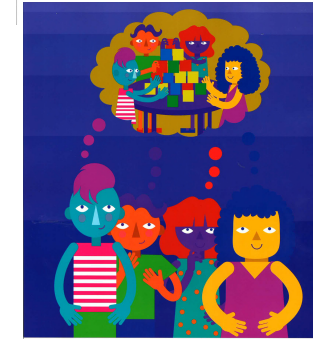
The Group Plan