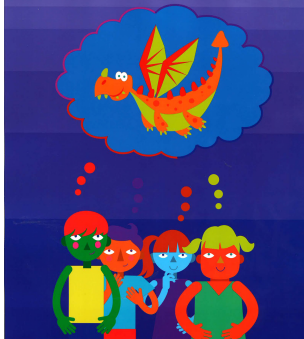
Sharing an Imagination