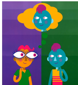
Thinking with Your Eyes