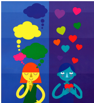
Thoughts and Feelings