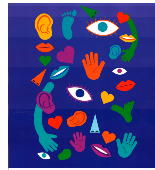
Whole Body Listening