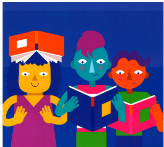
Hidden Rules & Expected-Unexpected Behaviors