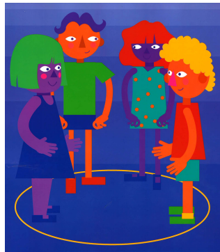
Body in the Group